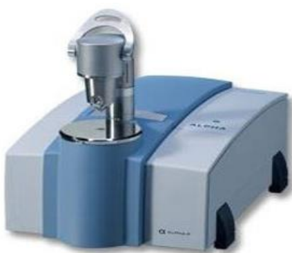
Bruker Alpha FT-IR Spectrophotometer

FTIR : FTIR is the most powerful tool for identifying the types of chemical bonds (functional groups) present in compounds. The wavelength of light absorbed is characteristic of chemical bond as can be seen in the annotated spectrum. The powdered sample of ocimum-gratissimum leaves was loaded in FTIR spectroscope with a scan range from 400 to 4,000 \text{cm}^{-1} in the mid IR region with a resolution of 4 \text{cm}^{-1} .