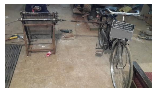
Fig -3 Pedal operated Drain Cleaner

The drainage systems are cleaned when there is no water in them i.e. when it is not raining, but when it is raining the drainage systems cannot be cleaned because of the harsh conditions of the rain which no one would volunteer to endure to ensure garbage does not enter into the drainage systems. There have been several attempts to develop equipment which would deal with the garbage when it is raining. The major examples of this include the net system which entails using a net to block the entrance or exit of the drainage system for the net to sieve out the net and The perforated metal sheet covering system using a protective metallic covering which is perforated on the drainage systems with the view of sieving out the garbage. But these methods proved less than 20% efficient.